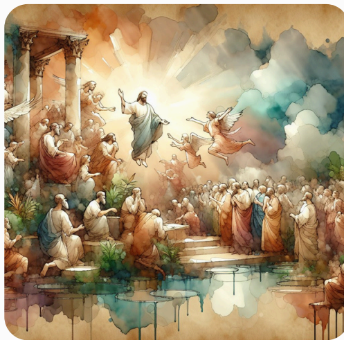
Philippians 2: 7